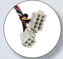
PT1200 EZ Connect for Dormakaba