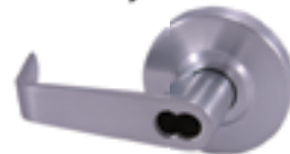
KIL - Entry IC