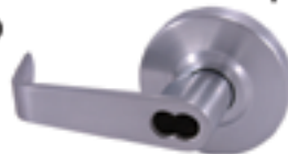
KIL - Storeroom IC