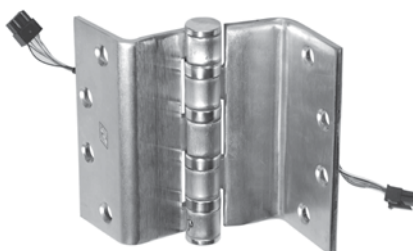
Most hinges including this Swing Clear Hinge can be electrically modified. Call 1-800-346-7707 for more information.